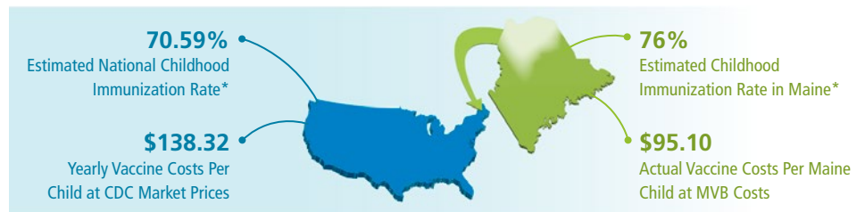
*2019 National Immunization Survey Childhood Report, published Oct. 2020

Most of the credit for this goes to Maine's healthcare providers, in cooperation with the Maine Center for Disease Control and Prevention's (CDC) vaccine distribution system, clinical expertise and technical support. The work of the Maine Vaccine Board (MVB) in overseeing the universal vaccine program has been aided by representatives of the Maine CDC, as well as the cooperation of employers and health insurers who do business in Maine.