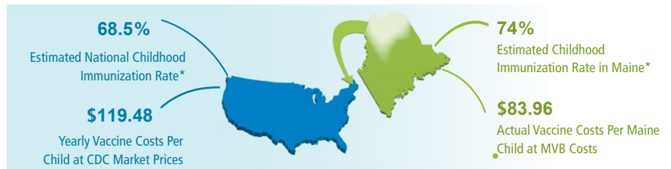
*2018 National Immunization Survey Childhood Report, published Dec. 2019

MVB accepted the Maine CDC's recommendation to add Td to the vaccine list making it available for providers to order.