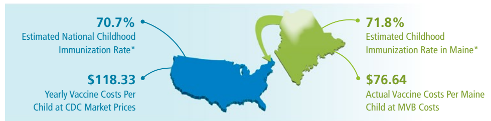
*2016 National Immunization Survey Childhood Report, published Nov. 2017

More important than the cost savings yielded by Maine's universal vaccine program for children ages 0 to 19, are the health benefits from improved immunization rates for Maine's children. Most of the credit for this goes to Maine's healthcare providers, in cooperation with the Maine CDC's vaccine distribution system, clinical expertise and technical support. The work of the Maine Vaccine Board in overseeing the universal vaccine program has been aided by representatives of the Maine CDC, as well as the cooperation of insurance companies who do business in Maine.